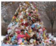
A pile of worthless "objects" (neologism coined by @nr)

3D printing + spam + micropayments = tribbles that you get billed for, as it replicates wildly out of control. 90% of everything is rubbish, and it's all in your spare room – or someone else's spare room, which you're forced to rent through AirBnB.