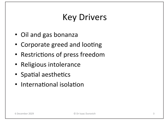
Figure 4. Slide 3: Key drivers

The report is structured in four parts, namely (1) Key drivers, (2) Decision points, (3), Implications and (4) Recommendations.