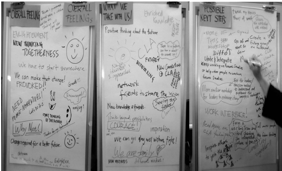
Figure 3. Learnings, takeaways and next steps.