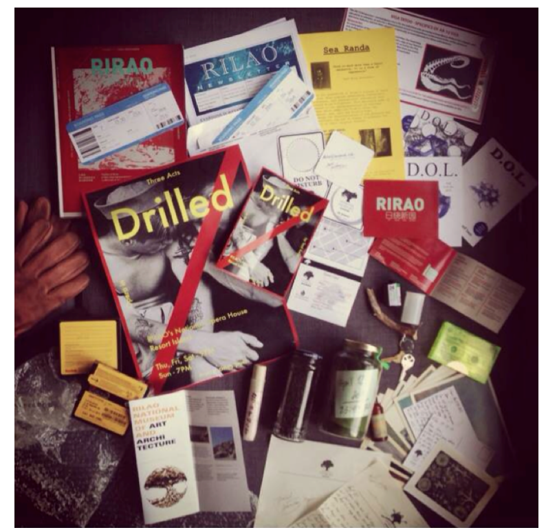
Figure 3 . One of the artifacts excavated from the world of Rilao by Murilo Hauser, a Master of Fine Arts Screenwriting candidate at USC, the Lost Suitcase consists in souvenirs gathered by an outsider who visited Rilao. Propaganda brochures from the Disciples of Lao, avant-garde seafood, an opera about oil workers; this anonymous traveler sampled various facets of the archipelago. Each physical fragment offers an entry point into some aspect of Rilao, including culture, food, architecture, and media.

An architecture student created a practical and dynamic robotic exoskeleton that could both obscure and display the Rilaoan wearer in their overpopulated environment, a games group developed an early VR experience for tourist visitors to Rilao, another game created terraforming to increase the land mass of the island, a writing student evolved the idea of a script contained in a physical suitcase filled with artifacts from the world that when read in random combinations could trigger entirely new stories.