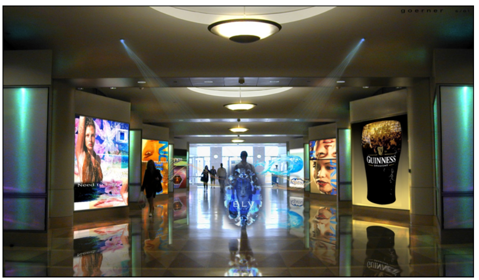
Figure 1. By conducting research in fields as diverse as architecture, engineering, physics,, urban planning, technology, and advertising, a team of experts developed a logic-driven vision of the near future for Minority Report.. For instance, interactive, customized marketing catered to the characters' personalities was woven throughout the film.

While all fiction may be enlightening for designers, science fiction should be of distinctive interest for three overlapping reasons: it reflects and shapes popular culture; the world building propositions of writers and the work of urban designers and architects share significant concerns; and sci-fi offers poetically rich thought experiments that can help designers understand the nuances of theory. (Childs, 2014)