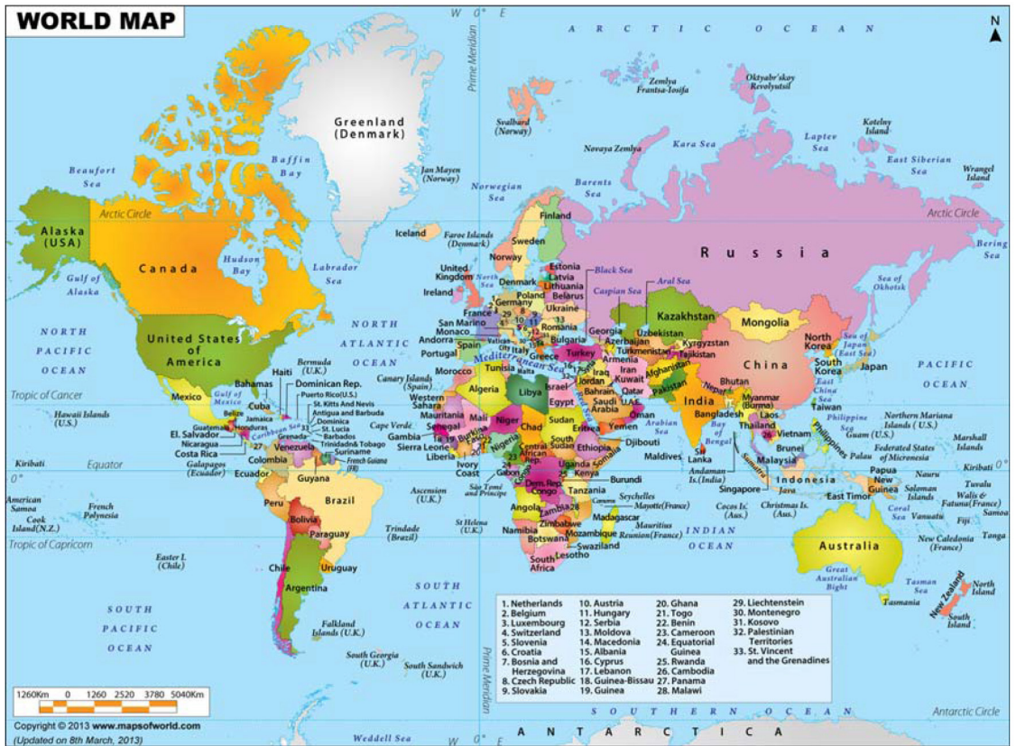
Figure 3. The Trumpian World View as a Map

Of course most Trump supporters are not comprised of Christian fundamentalists. Mr. Trump himself is highly secular in his habits, and hardly a model of Christian piety, but he espouses a world-view that conforms to an Old Testament sentiment. His closest political advisors include White nationalist Steve Bannon, but son-in-law Jared Kushner, who is an observant ultra-Orthodox Jew. This also aligns with his apparent affinity for Vladimir Putin, himself a Russian nationalist. As suggested in figure 3, this view is that of a political map projecting the world as flat with northern and southern latitudes distorted to make North America and Northern Eurasia look much larger than they actually are. In Mr. Trump's world-view, size matters.