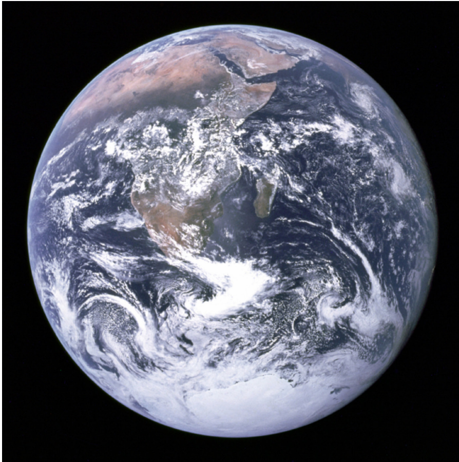
Figure 4. Earth as Seen from Space