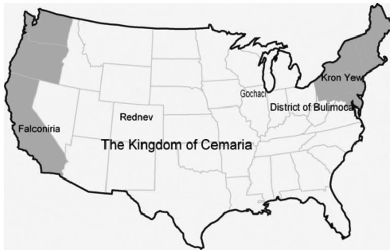
Figure 2. The Great Kingdom of Cemaria

Cemaria was never great again. The District of Bulimoca remained the capital city where the king and court resided. The other kingdoms shunned Cemaria because of the erratic decisions of the jester king. They feared being drawn into a war not of their making. Though ravaged by the demon hordes of Metical, the kingdoms of Suasri and Hanci grew in strength. The problems within the joint kingdoms of Ropue meant they were unable to be great again.