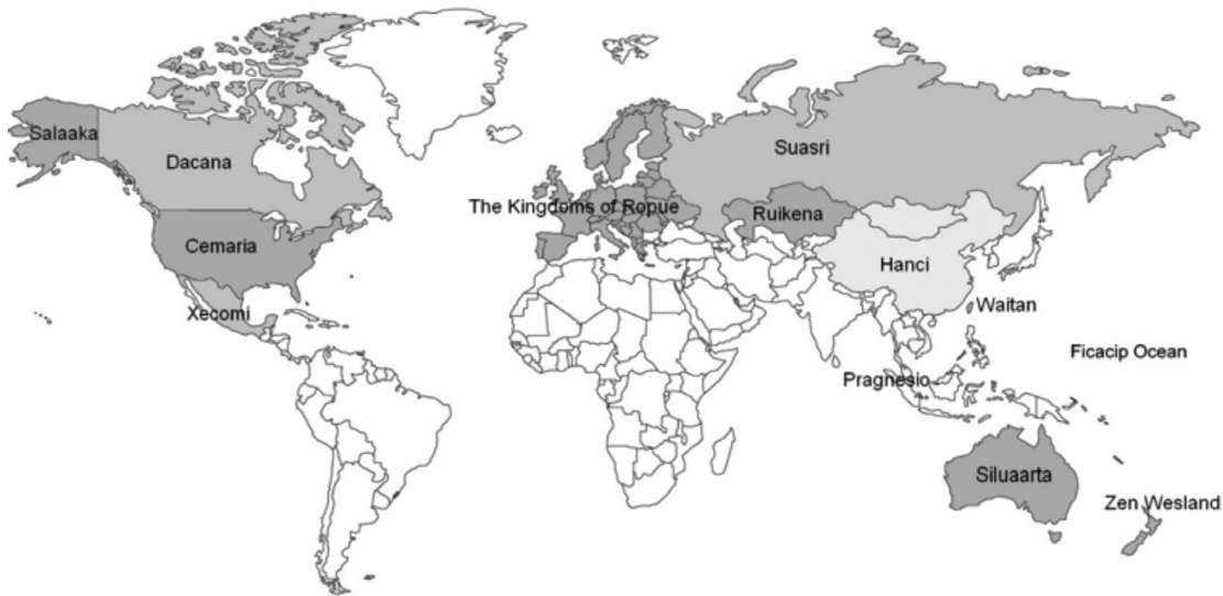
Figure 1. The kingdoms of the world