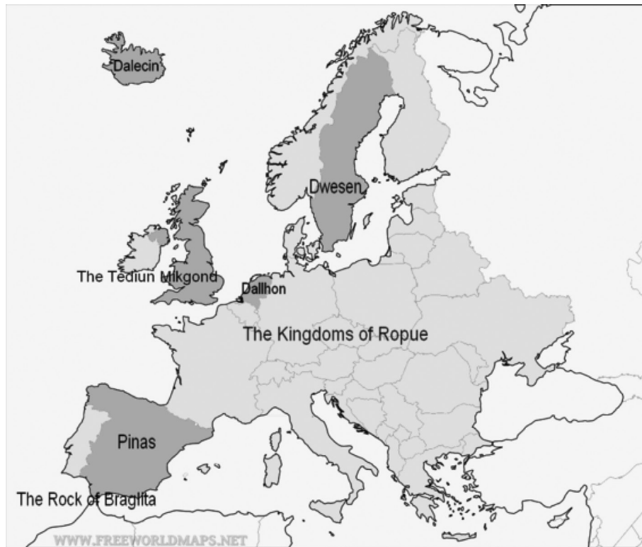
Figure 3. The Kingdoms of Ropue

Storms, floods and earthquakes caused by the Metical demon horde struck in all the kingdoms. In a bid to show its strength with dwindling power, a disagreement between Cemaria and Hanci over islands in the South Hanci Seas resulted in the Lecunra dragons being released. The kingdom of Suasri took advantage of the situation and became great, but they had their own merchant families who continued in the same way as the merchant families of Cemaria. This dream could turn into the destruction of the third dream.