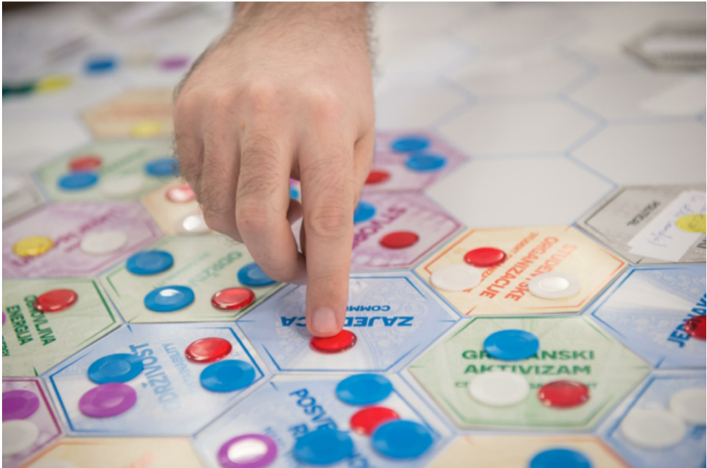
Figure 3. Montenegro Foresight eXplorer in Action

Figure 4 visualizes all of the opportunity (green), challenge (red), actor (amber), and value (blue) cards placed by participants. Using the same color system as the cards, this image uses the workshop (Youth Voices and Expert Voices) as center points to show the relations and connections between the four main categories. Looking at the bottom of the circle, which is sorted alphabetically, one can see that Youth was one of the most popular cards, and it was used as both an Opportunity and Actor during both workshops, which demonstrates the overall emphasis on Youth that emerged during both workshops. Expert Voices, whose attendees were mostly over 30 years old, were more likely to see Youth as an Actor.