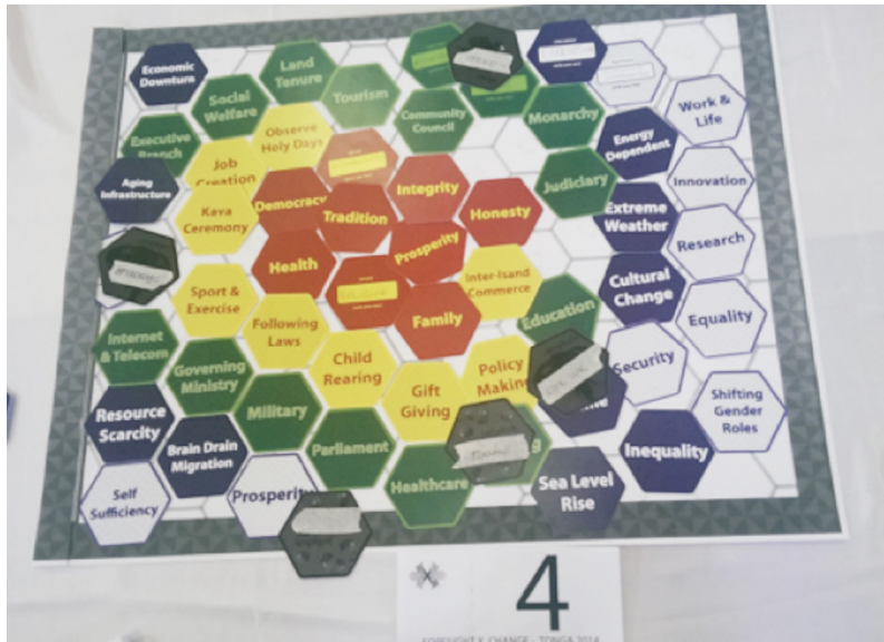
Figure 1. Snapshot of a Completed Board