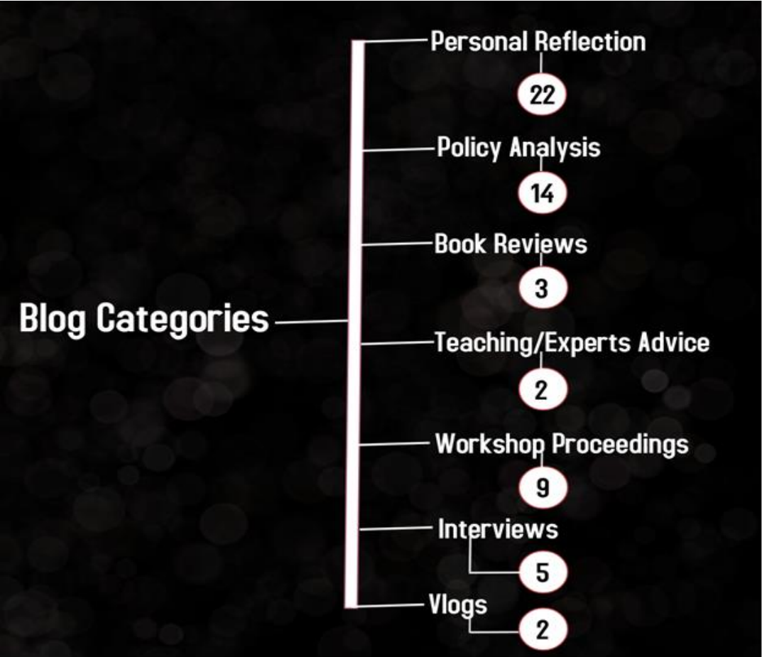
Fig. 2: Breakdown of JFS blogs according to categories

In terms of categories, the blog has attracted an assorted canopy of submission categories. These include 2 video blogs, 3 book reviews, 9 workshop proceedings, 5 interviews, 22 personal reflections, 14 policy analysis and 8 teaching/expert advice submissions. There are also 4 articles, 2 in Persian and 1 in Mandarin and 1 in Spanish, which are translations of published work on the JFS blog (see Fig. 2).