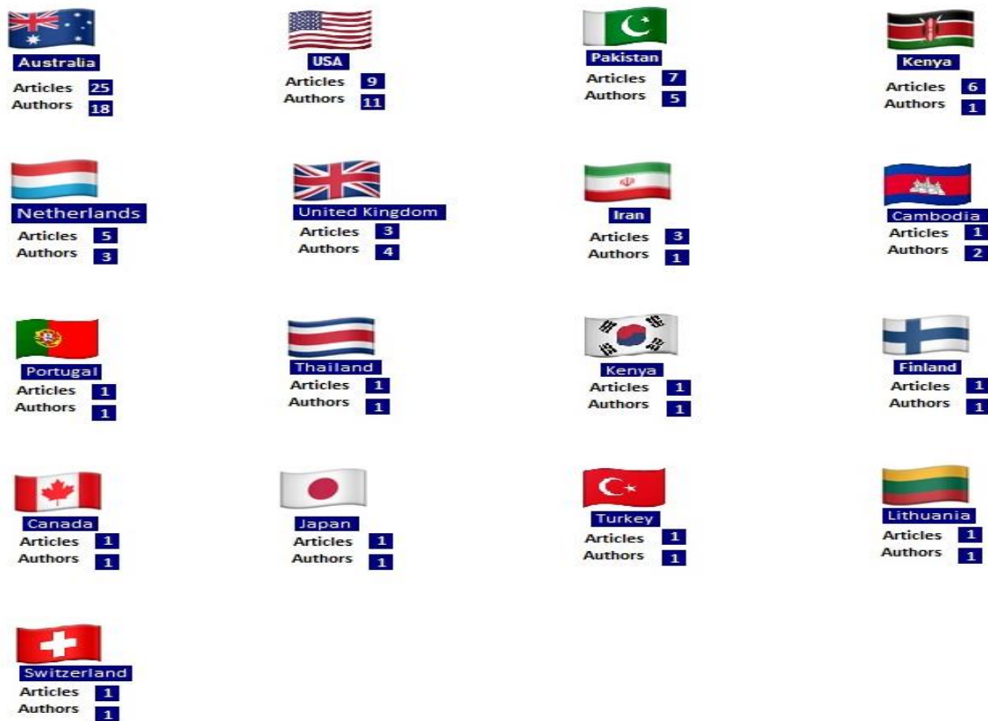
Fig. 1: Country-wise breakdown of the JFS blog submissions and authors

The website for Journal of Futures Studies is www.jfsdigital.org , hosted on a WordPress Platform. Google Analytics was used to analyze data on the blog submissions and usage. Google Analytics is an open tool that provides free